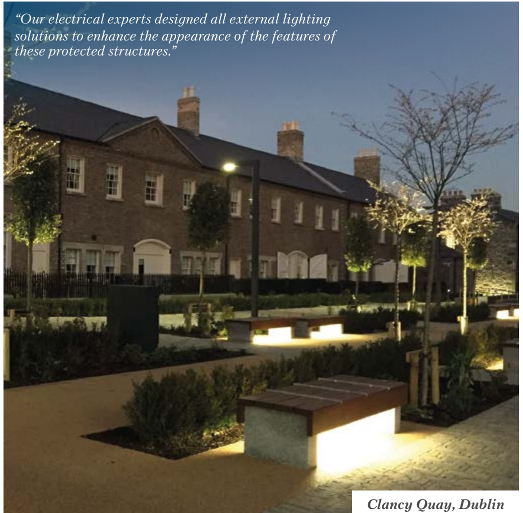
Clancy Quay, Dublin

“Our electrical experts designed all external lighting solutions to enhance the appearance of the features of these protected structures.”