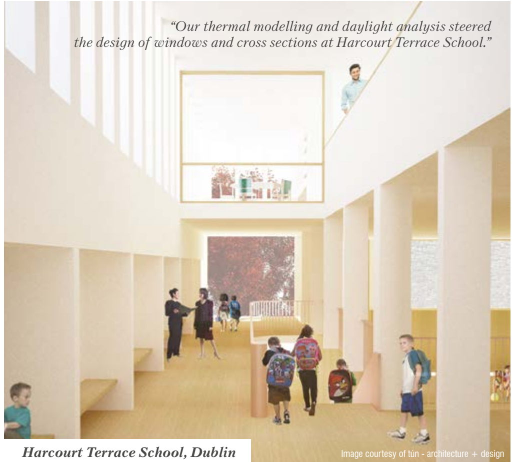
Harcourt Terrace School, Dublin

“Our thermal modelling and daylight analysis steered the design of windows and cross sections at Harcourt Terrace School.”