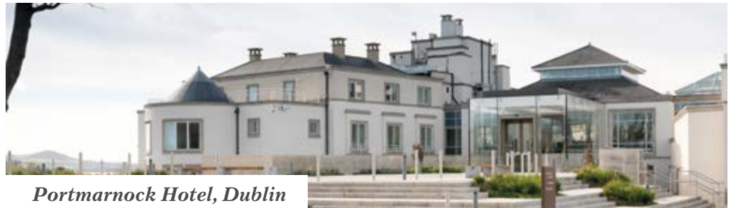
Portmarnock Hotel, Dublin

Our team were appointed on this extensive refurbishment of the Portmarnock Hotel & Golf Links. Works included the renovation of the site's existing 90-bedrooms, car park, entrance lobby, reception area, residents bar and restaurant, as well as the provision of new gym, spa and meeting room facilities. All renovation works were undertaken in a live environment.