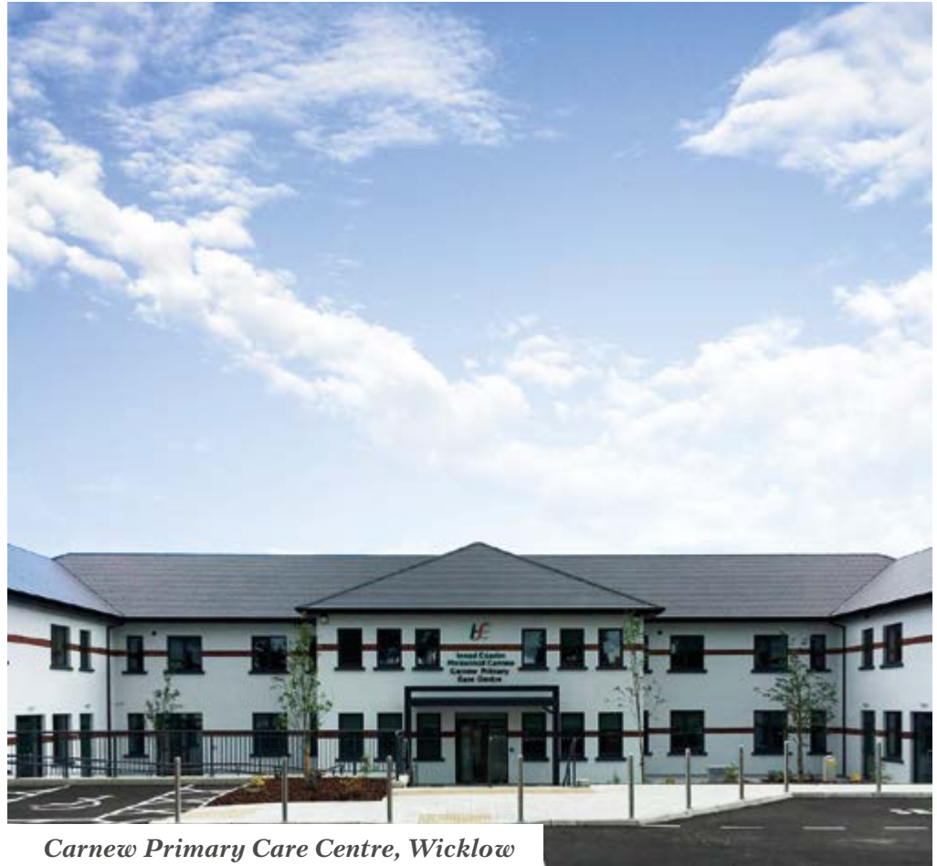
Carnew Primary Care Centre, Wicklow

Our team have in-depth knowledge of the healthcare sector having been involved in the design of numerous public and private sector hospitals, nursing homes and primary care centres. Building Services installations are critical to the correct operation of healthcare buildings as they provide life safety, infection control and key operational functions which must comply with the Health Technical Memoranda (HTM) and Health Building Notes (HBN) guidance standards.