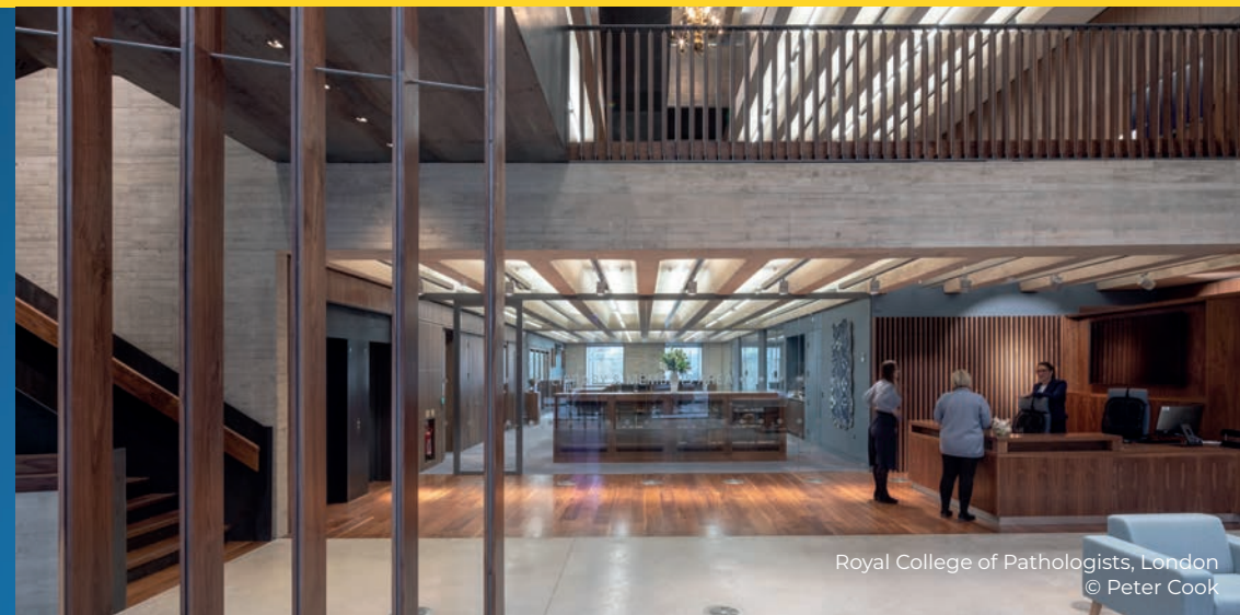
Royal College of Pathologists, London

GCSEs (Grades A*-C / 9-4) in a minimum of five subjects including English Language and Maths. Minimum of two A Levels (or equivalent) at grades A*-C with at least one (ideally both) in Geography, Biology, Chemistry, Environmental Science, Geology or Physics. Alternatively to A Levels would be a Level 3 qualification such as a BTEC Extended Diploma, or having completed a Level 3 Apprenticeship in a Science or Engineering-based subject.