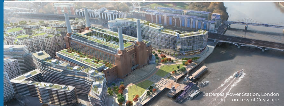
Battersea Power Station, London