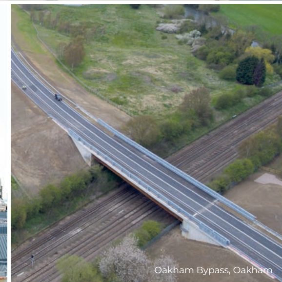
Oakham Bypass, Oakham